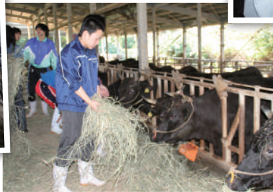
Wear farm boots just like the locals!