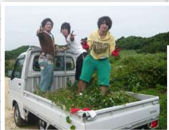
Take photos with the farming equipment