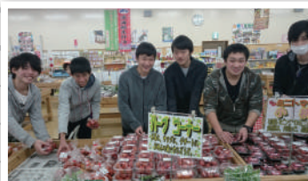
Learn the process of shipping tomatoes

You will come to appreciate all the sweat and tears it takes to get something simple, yet indispensable, as food in your stomach.