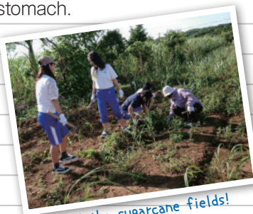
Weed the sugarcane fields!