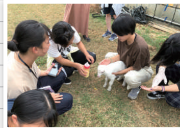
Pet the goats!

Animal husbandry is one of the many different branches of farming in Miyako. Get a first hand experience of what it's like to properly take care of a real life farm animal. And learn how important, difficult and rewarding it can truly be.