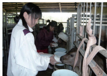
Feed the cows!