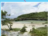
Ingya Marine Garden