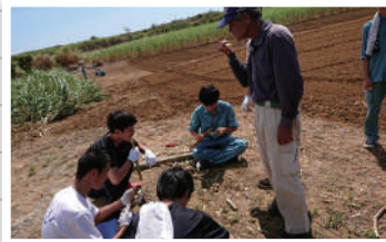
Taste sugarcane fiber