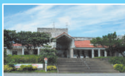
● Gusukube Community Center